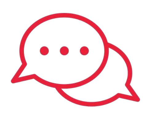
Communication & Soft Skills